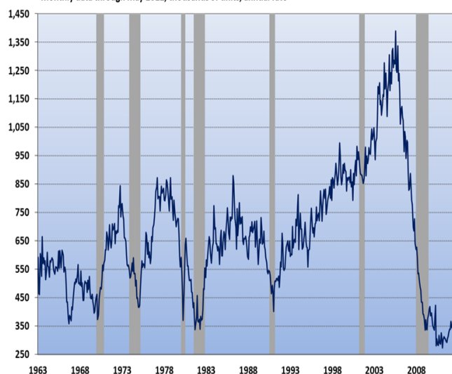
Sales of New Single-Family Homes Monthly data through May 2012, thousands of units, annual rate

SOURCE: Census Bureau, U.S. Department of Commerce.